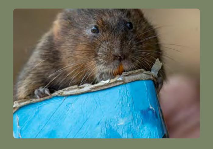
Water vole reintroductions