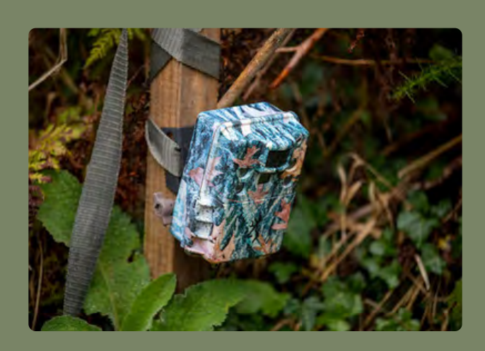
Camera trap monitoring