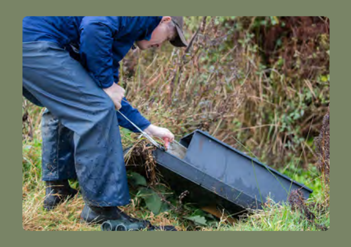
American mink monitoring