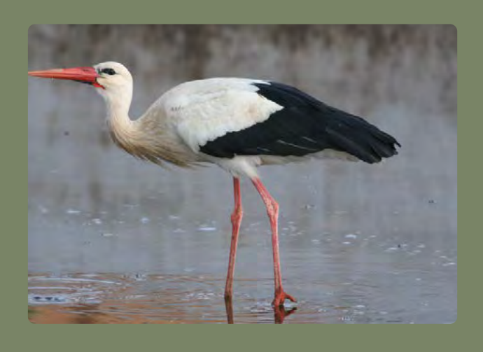
Further species reintroductions