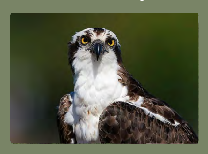
Restoring osprey populations