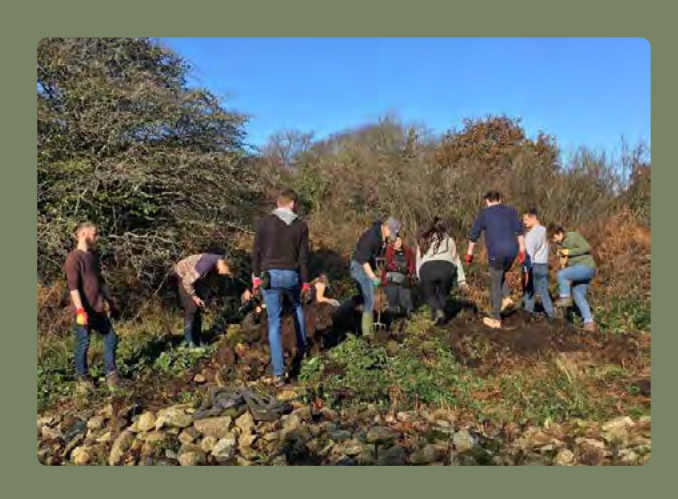
Increased community engagement