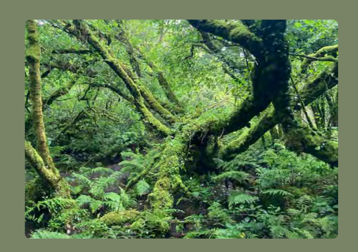
Temperate rainforest restoration