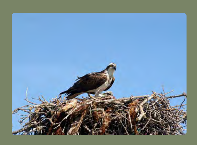
Wider network of osprey nests/bird tanslocations