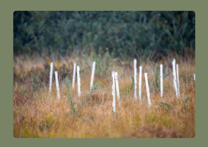
Marsh fritillary conservation